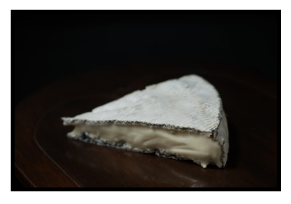
We're now making our own Camembert! Spread liberally across a well lived life.