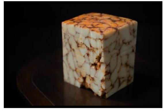
Our Chipotle Espresso Cheddar -The folks at Dark Matter pull like 70 triple shots for each batch of our pepper sauce