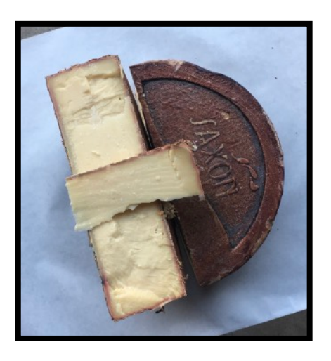
Saxon's Creamery 'Saxony' that we aged out 4 years. Mind gripping crunchy brown butter toasted nut amazing-ness.

We make our fresh dill jack just outside of Shawano, WI using milk from small family farms up and down nearby country roads.