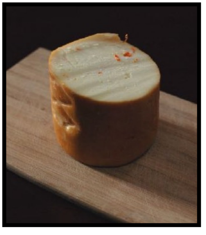
Another of the cheeses we make - to this Jack we add habaneros & then lightly smoke the logs in applewood.