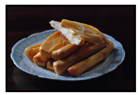
World's best string cheese made better - hand pulled by Cesar & we then have 'em smoked gently in applewood.