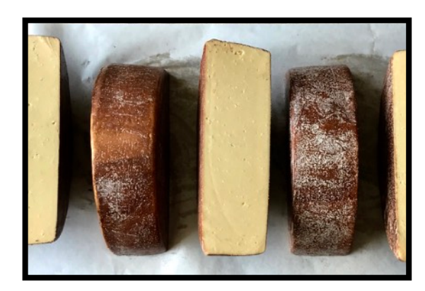
Our 'Bella-gian Red' We double aged Bellavitano, and then bathed the wheels in New Glarus Belgian Red Ale.